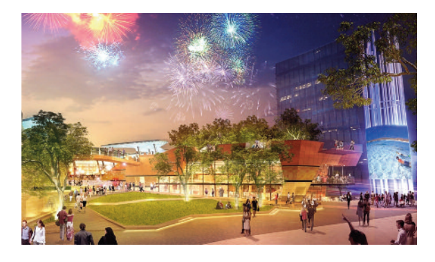
Yagan Square Perth, Australia's most exciting civic LED project about to get underway and which will introduce new technologies to Australia.