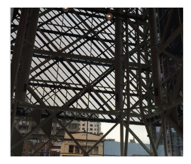
Emporium is the leading example of light transparent LED in Australia with close to 80% light pass through. However Ci also offer mesh LED of various transparency levels for a range of applications.