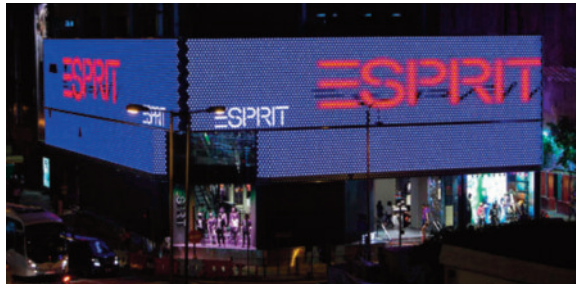
Esprit Hong Kong, an early international facade example