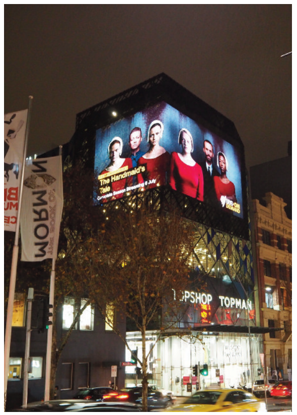
Australia's first, large-scale light transparent media façade, one that allows a view to the outside world from behind a stunning LED image shown on the outside of the building.