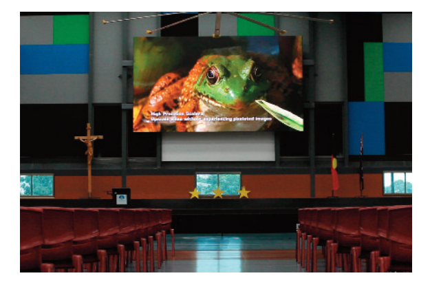
Formal Presentation Spaces