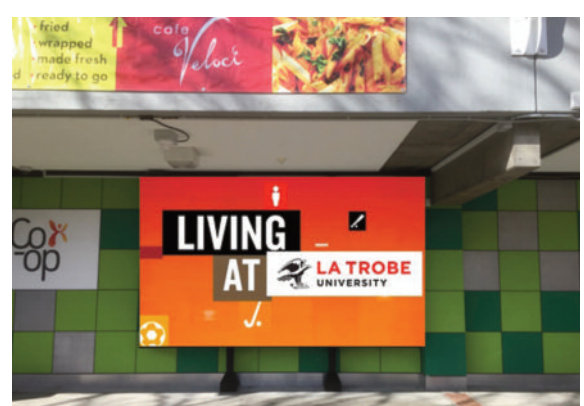
AFTER - Outdoor LED Videowall