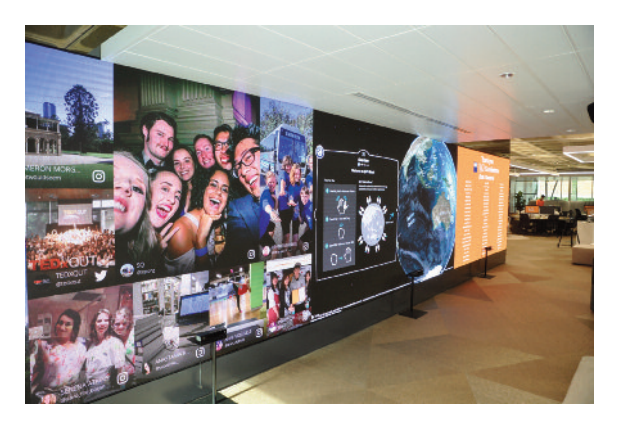
Student Engagement Centre

LED is rapidly replacing projection across a range of learning space applications, from lecture theatres to research commons. However LED also making waves in other aspects of education, from indoor sports centres, school assembly halls, student engagement centres, outdoor student plazas, outdoor scoreboards, and outdoor campus billboards that communicate to the general public.