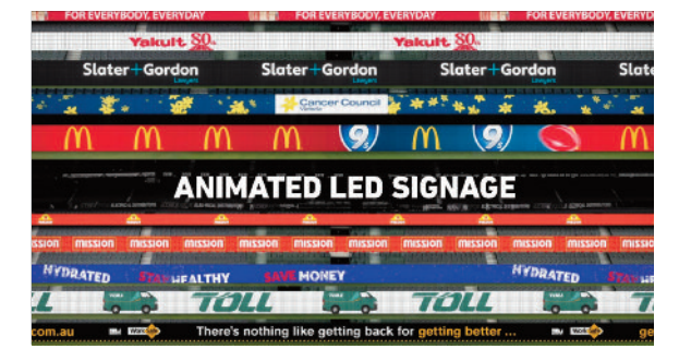
MCG and Etihad, the biggest LED project ever in Australia and hailed around the world as being best in class.

From shopping centre plazas to billboards, from Australia's best stadiums to Australia's best civic precincts, from retail signposting to commercial building signage, from school signage to light transparent media facades, Ci can provide something suitable for every possible application of LED display. Brands represented include VideroLED, Samsung, NEC, LG and Panasonic.