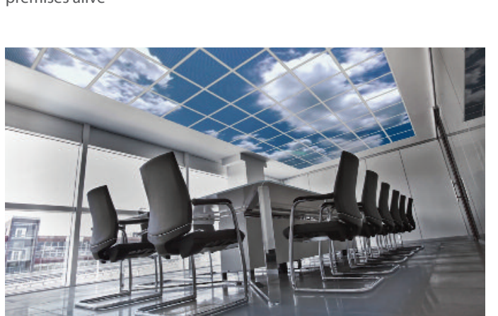
"Your Ceiling LED tiles have made such a huge difference to our guest meeting rooms."

Meeting rooms can become magical workspaces