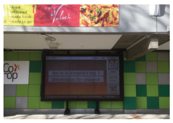
BEFORE - Outdoor LCD Videowall