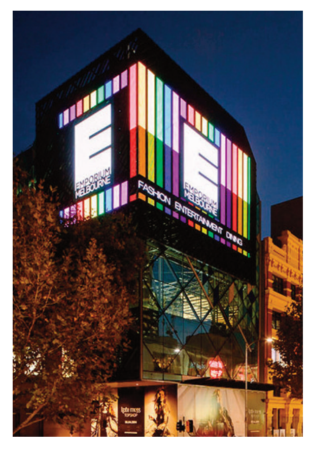
Ci's acclaimed Emporium Facade with light transparency.

Façade LED affords display on the grandest scale of all. The whole building can become the digital canvas. This means the plainest of plain buildings can be transformed by light into something that commands attention.