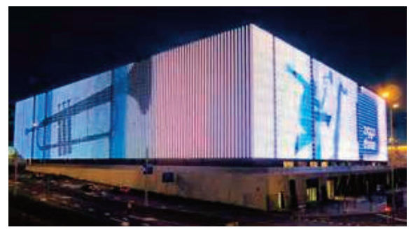
Ziggo Dome Amsterdam, a brilliant facade execution.