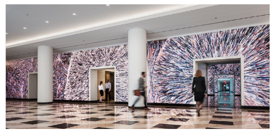
Pics above are from 350 Mission and ESI's Saleforce Lobby, both in San Francisco