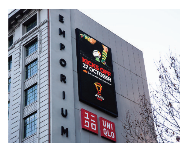
All these Ci LED installations have stood the test of time, not just for durability but for unrivalled support.