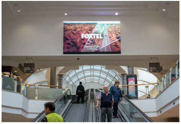
Equipping shopping centres with LED display and optional sound.