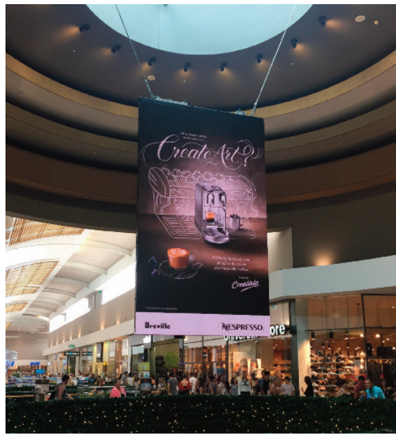
As the examples on this page demonstrate, Ci can span a range of installation requirements.